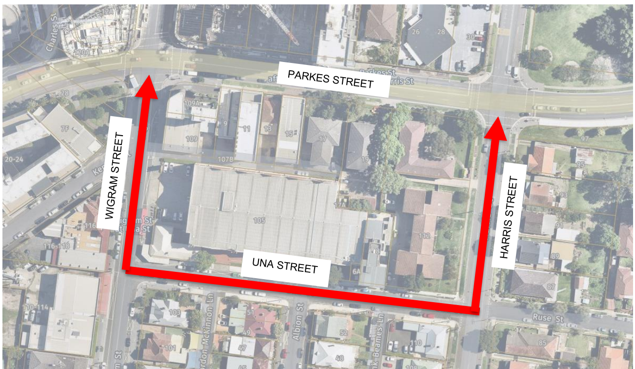
Figure 3: Alternative route for residents accessing 17 Parkes Street coming from an eastbound direction or leaving the property to travel in the westbound direction

It is considered that the traffic implications for not having the median island at this location outweigh the inconvenience caused to residents. Accordingly, it is recommended that the proposed median island be installed by the developer as per their conditions of consent.