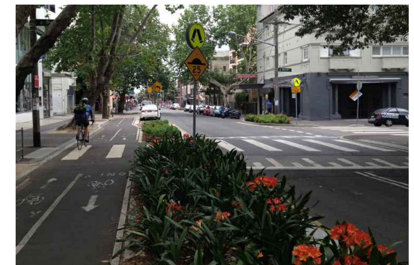
ZEBRA CROSSING ADJACENT BI-DIRECTIONAL CYCLEWAY