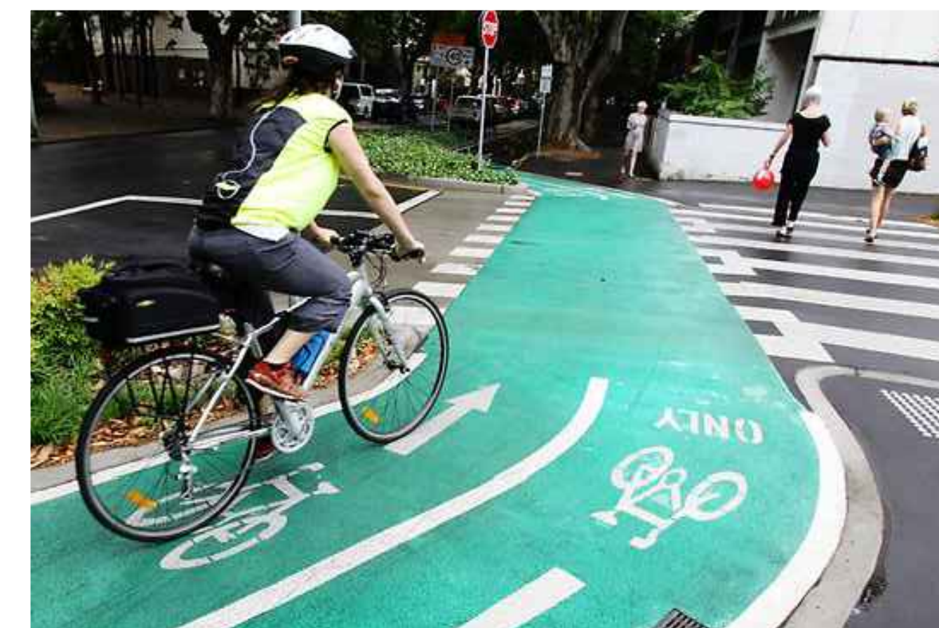
BEND OUT CROSSING AT INTERSECTION

The roundabout at the Piazza is also proposed to be upgraded to modern standards, helping increase safety and allow a more generous turning space.