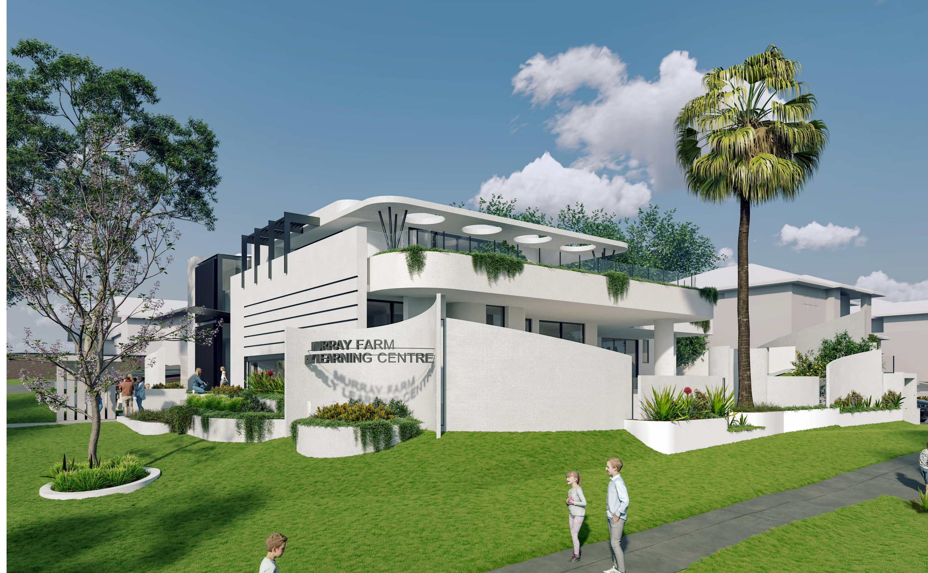
VIEW FROM MURRAY FARM ROAD (NORTH-EAST)