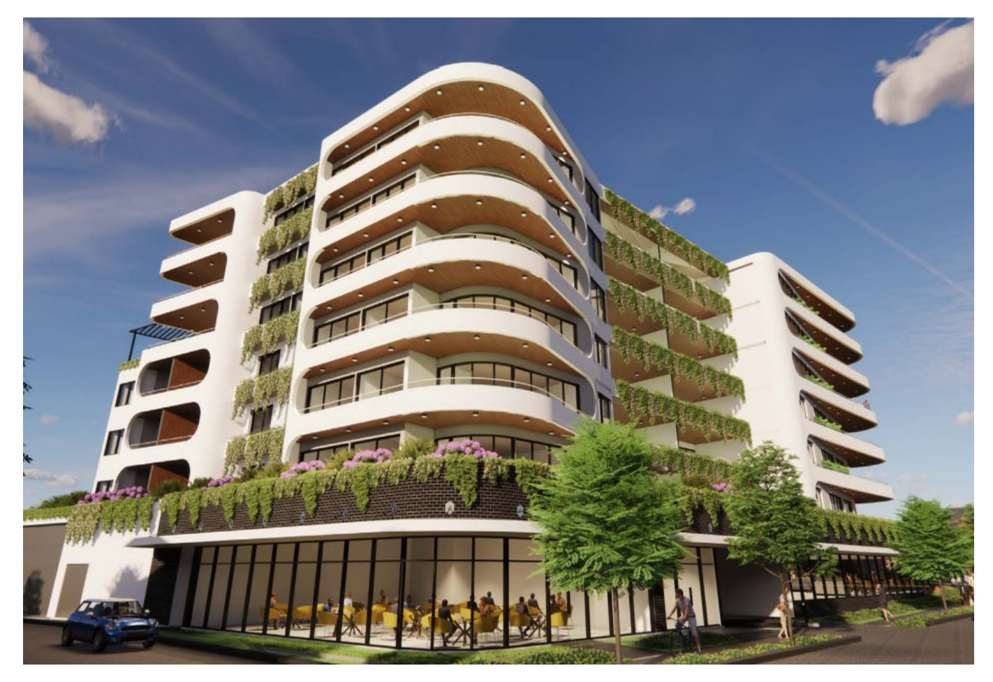
Figure 1 Photomontage of the proposed development