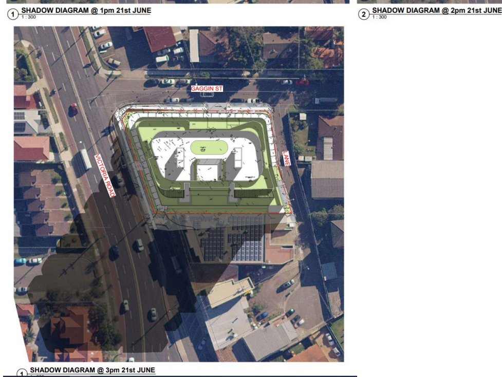
Shadow diagrams during the winter solstice Figure 2

This demonstrates that the proposed FSR variation results in acceptable solar impacts to surrounding properties in a manner consistent with the controls of the PDCP 2011. As the proposal is designed to ensure that neighbouring properties achieve at least three hours of solar access to primary living areas and private open space, the shadow impacts of the proposal are considered to be acceptable.