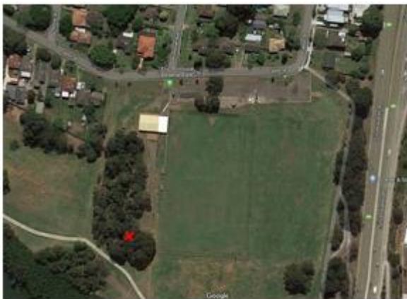
George Kendall Riverside Park, Ermington